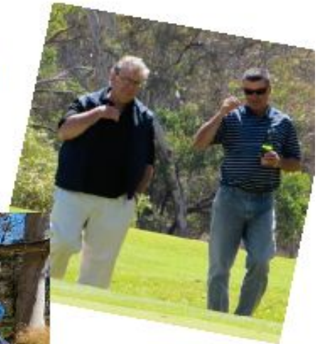
Deep in conversation "How do we teach them to play?"