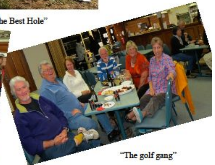
"The golf gang"