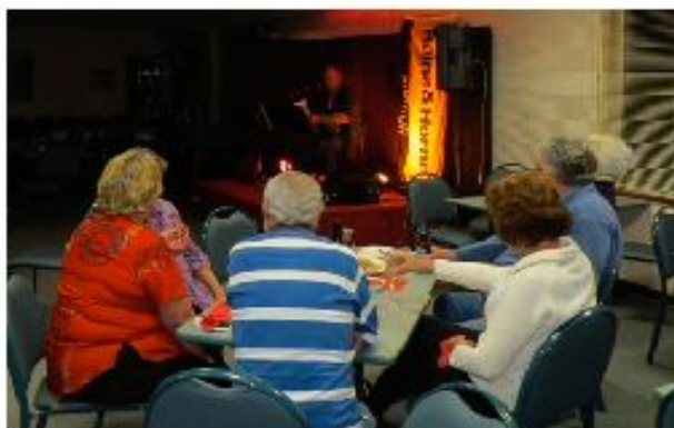
"The party animals"