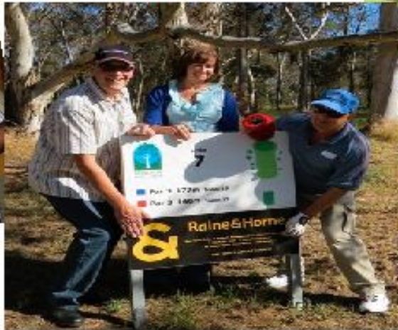
"The Best Hole"