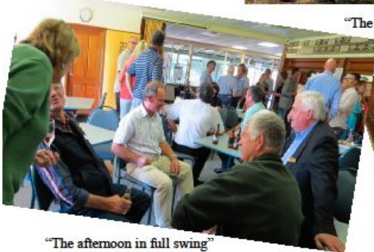
"The afternoon in full swing"