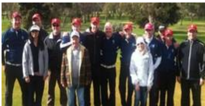
Victorious Players, caddies & Mascot.