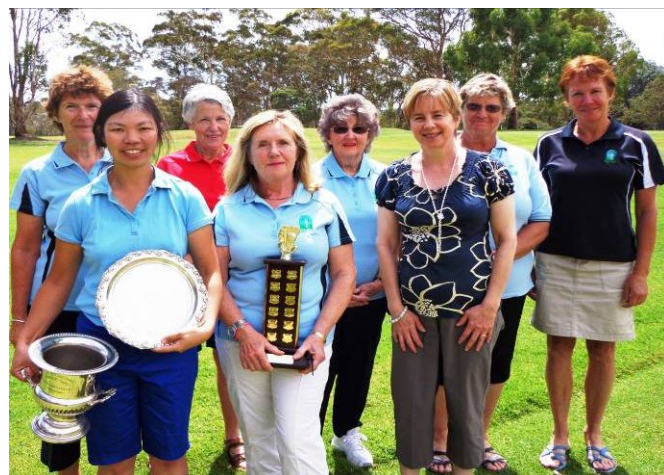
Women's Golf Summer Comp winners