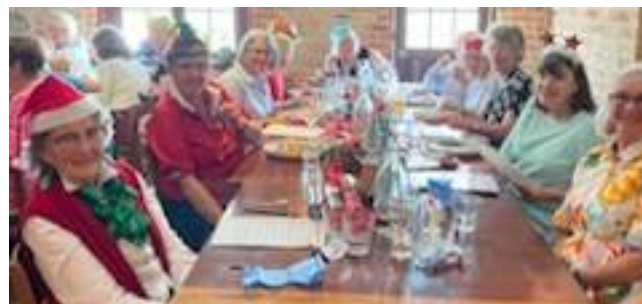
Dressing up for Christmas