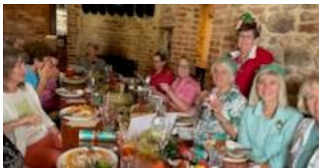
Enjoying Christmas Lunch