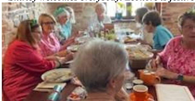
Another table of happy Women