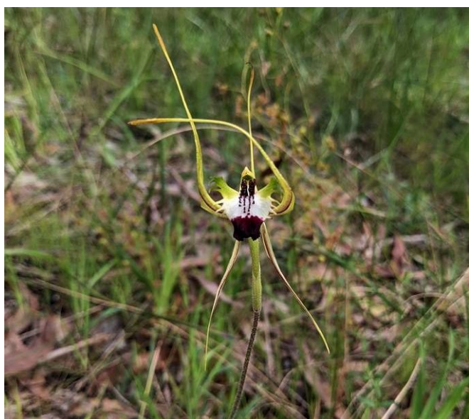
King Spider Orchid