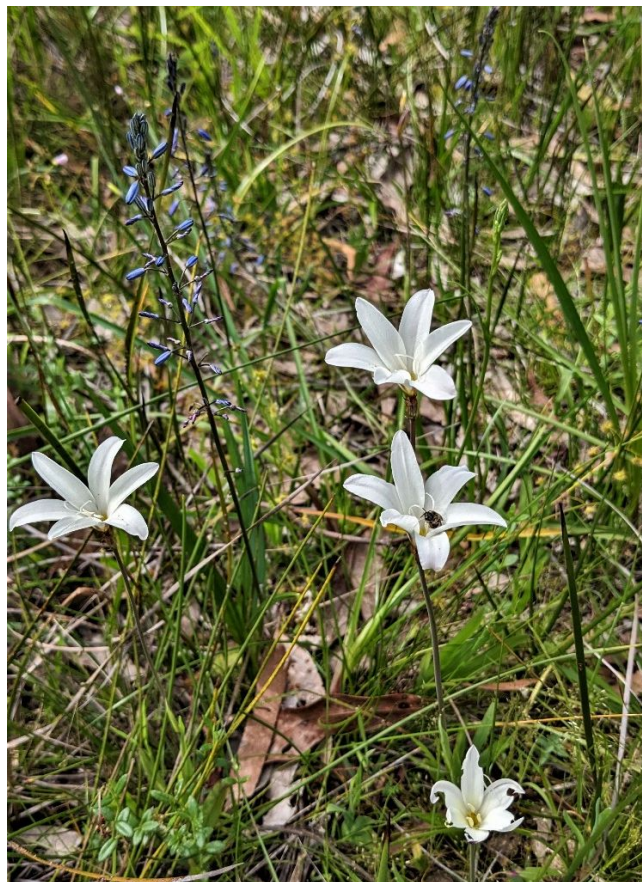
Invasive white Sparaxis with native blue grass lily

Unfortunately the invasive exotic white Harlequin lilies ( Sparaxis sp) were also in full flower, showing us just how many juvenile individuals reached maturity following last year's professional and volunteer control efforts on the adults.