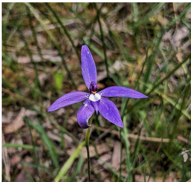
Purple Cockatoo Orchid

Yellow Bulbine lilies were probably the first to catch our attention, followed by Blue grass-lilies, white Milkmaids and now the slender tall pink Vanilla lilies. A number of small terrestrial orchids are scattered through this patch; the Purple cockatoos with their small white labellum were the most showy but, for the sharp eyed there were also King Spider, Donkey and Greenhoods.