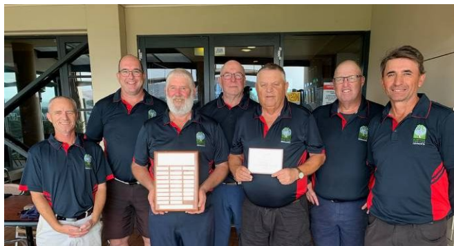
C1 Winning Team

The C1 team were the winners 8-4, amidst much celebration.