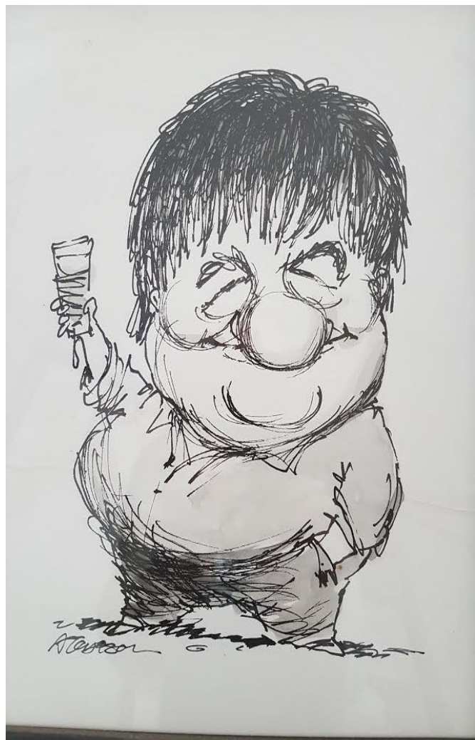
Taken from the July 2017 Putter