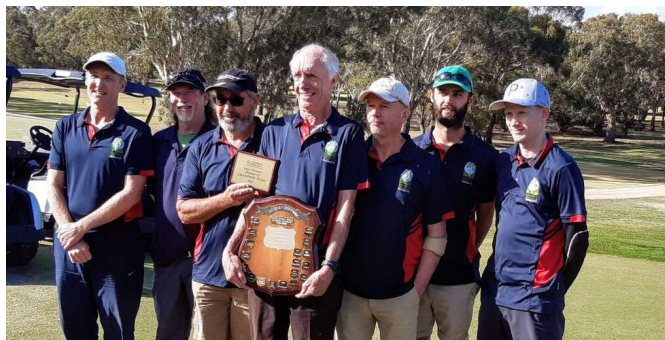
C2 Winning Team