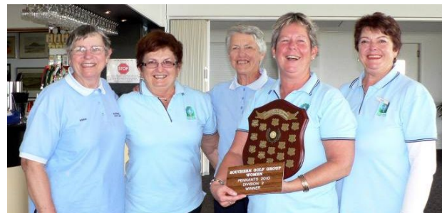
Echunga Division 2 Team.

Echunga Women had the sweetest success of all in bringing home both Division 2 and Division 3 Pennant shields for 2010.