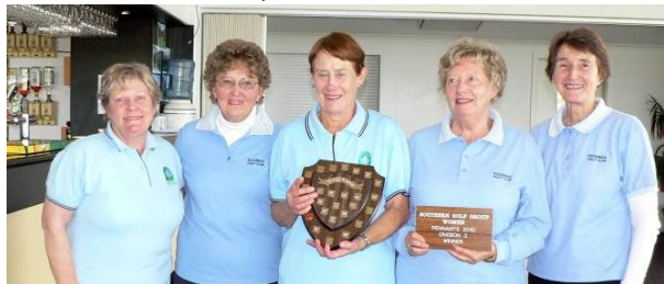
Echunga Division 3 Team.

Division 2 achieved three wins out of 4 matches and Division 3 won 4½ matches out of 6 to qualify for the tightly contested finals played at Victor Harbor on 7th June, 2010.