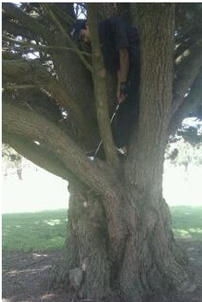
Taken from the December 2011 Putter

A blonde and a redhead have a ranch. They have just lost their bull. The women need to buy another, but only have $500. The redhead tells the blonde, "I will go to the market and see if I can find one for under that amount. If I can, I will send you a telegram." She goes to the market and finds one for $499. Having only one dollar left, she goes to the telegraph office and finds out that it costs one dollar per word. She is stumped on how to tell the blonde to bring the truck and trailer. Finally, she tells the telegraph operator to send the word "comfortable." Skeptical, the operator asks, "How will she know to come with the trailer from just that word?" The redhead replies, "She's a blonde so she reads slow: 'Come for ta bull.'"