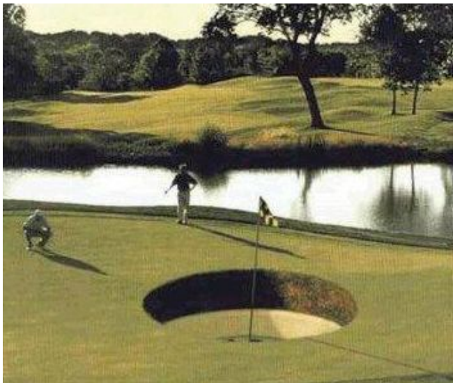
“Golf in Heaven”